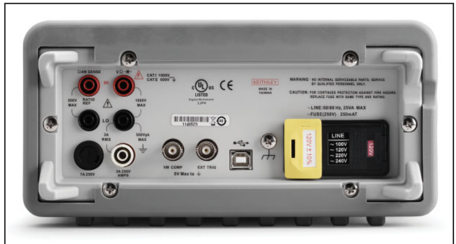
Model 2100 rear panel

AC CMRR: 70dB (for 1kΩ unbalance LO lead). POWER SUPPLY: 120V/220V/240V. POWER LINE FREQUENCY: 50/60Hz auto detected. POWER CONSUMPTION: 25VA max. DIGITAL I/O INTERFACE: USB-compatible Type B connection. ENVIRONMENT: For indoor use only. OPERATING TEMPERATURE: 5° to 40°C. OPERATING HUMIDITY: Maximum relative humidity 80% for temperature up to 31°C, decreasing linearly to 50% relative humidity at 40°C. STORAGE TEMPERATURE: –25° to 65°C. OPERATING ALTITUDE: Up to 2000m above sea level. BENCH DIMENSIONS (with handles and feet): 112mm high × 256mm wide × 375mm deep (4.4 in. × 10.1 in. × 14.75 in.). WEIGHT: 4.1kg (9 lbs.). SAFETY: Conforms to European Union Directive 73/23/ECC, EN61010-1, UL61010-1:2004. EMC: Conforms to European Union Directive 89/336/EEC, EN61326-1. WARRANTY: One year.