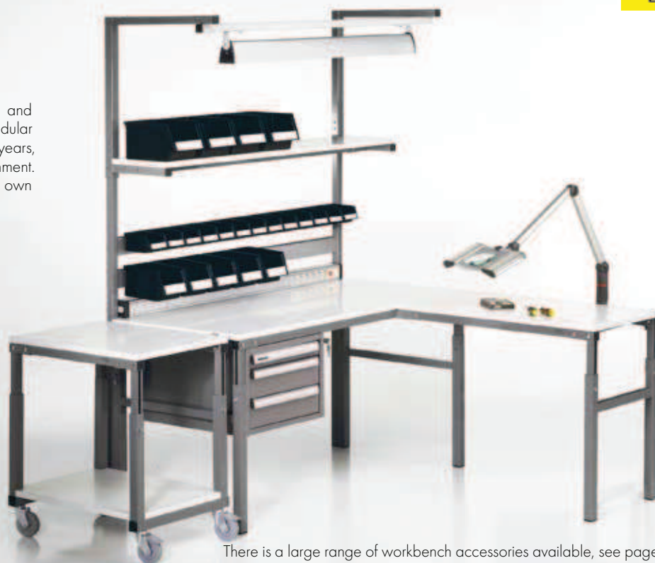
There is a large range of workbench accessories available, see page 11.

Designed for use in today's production and assembly environments, this definitive modular system, developed over more than 35 years, provides a high quality working environment. Customise your workstation to your own requirements.