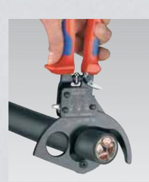
Ratchet principle and two-stage ratchet drive for easier cutting.

95 31 280: large cutting capacity: maximum 52 mm dia. / 380 mm <sup>2</sup>