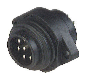
CA 6 GS

Industrial Connectors:Circular connectors CA series:Cable plug and panel-mounted connector