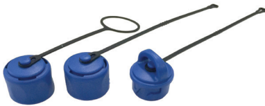
PXP4081 PXP4082 PXP4083