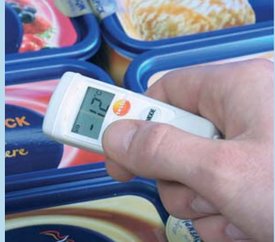
For rapid measurements on the fly