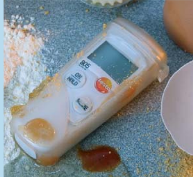
TopSafe, the indestructible and water-tight protection case