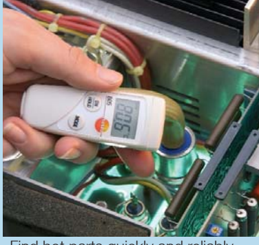
Find hot parts quickly and reliably