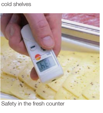
testo 805, mini infrared thermometer