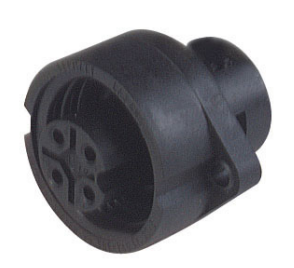
CA 3 GD

Industrial Connectors:Circular connectors CA series:Cable socket and panel-mounted socket