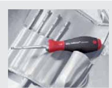
The Wiha SYSTEM 6 range is the compact all-rounder for different applications.

With the Wiha SYSTEM 6 series you always have the right tool on hand for a wide range of applications - ideal for industry, trade and the ambitious handymen.