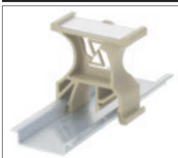
Mouting rails for Group label holders

The group label holder GT 2 is clicked onto the mounting rail. The insertion label ESO GT 2 and the protective strip STR GT 2 complete the holder.