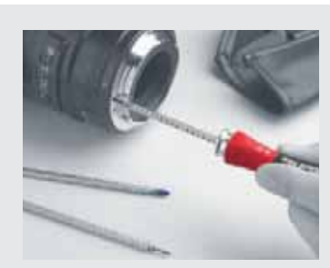
Convincing variety and quality. SYSTEM 4 – a real multi-tasker.

We offer SYSTEM 4 sets in compact roll-up pouches, rigid metal and easy access plastic boxes.