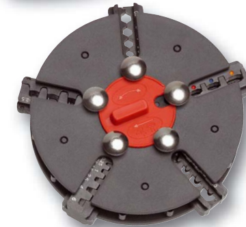
97 33 02 crimping pliers with round magazine and 5 interchangeable dies for non-insulated open plug-type connectors; insulated terminals + plug connectors; end sleeves (ferrules); non-insulated terminals + plug connectors; non-insulated butt connectors