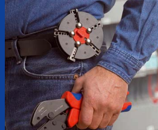
Round magazine with belt clip: interchangeable dies are always ready to hand