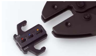
Catch for exchange of crimping dies