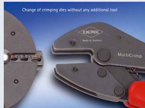
Change of crimping dies without any additional tool

The electrician travelling in mobile services needs at least 3 different crimping pliers to be prepared for crimping of the most common standard connectors. The new MultiCrimp system now offers the compact solution for the professional user: a set of optionally 3 or 5 interchangeable crimping dies in a quick changer magazine for the most common applications on the spot.