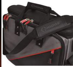
2 Padded handle and shoulder strap for maximum comfort