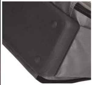
1 100% waterproof and crackproof rubberised base

Featuring a 100% waterproof, rubber base designed to keep tools / documents protected and dry, the Technician's Tool Case Plus is a unique storage solution specifically designed with the technician in mind, including fold out panels for easy tool access.