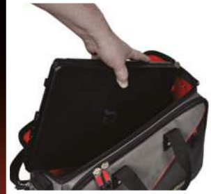
3 Padded central compartment fits laptop