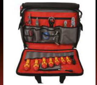
4 Pockets and holders including fold out panels for easy tool access