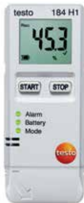
testo 184 H1