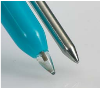
pH2 probe head for semisolid substances

Together with experts from industry and the trades, Testo has developed innovative solutions.