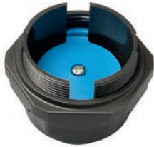
Photo: Inside view