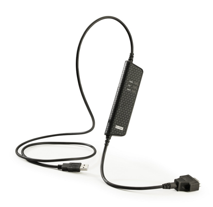
Figure 1: Kvaser Hybrid CAN/LIN

Kvaser Hybrid CAN/LIN is a single channel interface where the channel can be opened either as CAN or LIN. The Kvaser Hybrid CAN/LIN is compatible with applications that use Kvaser's CANlib and LINlib.