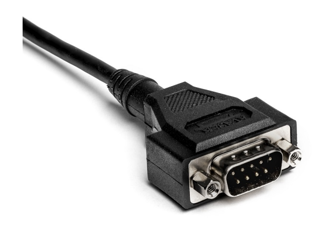
Figure 3: CAN/LIN connector on Kvaser Hybrid CAN/LIN

The Kvaser Hybrid CAN/LIN has one CAN/LIN channel in a 9-pin D-SUB CAN connector (see Figure 3). See Section 4.3, CAN/LIN connector, on Page 13 for pinout information.