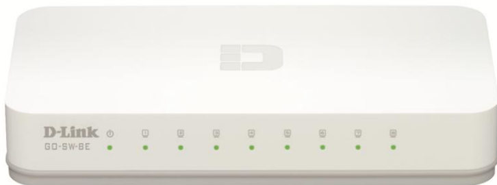
8-PORT FAST ETHERNET EASY DESKTOP SWITCH

The figure below shows the front panel of the GO-SW-8E.