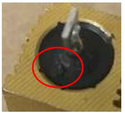
HS25 - 50 - moulded using new tooling