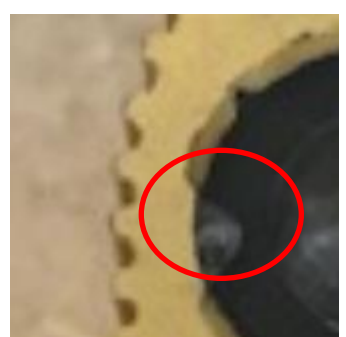
HS25 – 50 current – above