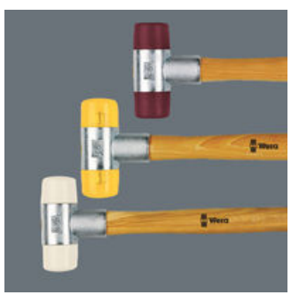
They come in soft, medium and hard designs for a wide range of applications from universal use to splinter-free applications on sharpedged work pieces.