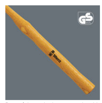
Powerful work is ensured with handles out of high quality ash wood.