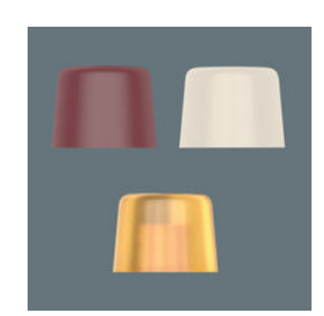
Versatile use thanks to the soft faced heads that can be retrospectively fitted.