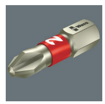
Wera stainless steel bits are manufactured out of stainless steel so unsightly rust can be avoided. The stainless steel bits from Wera are vacuum ice-hardened and have the hardness and strength needed for screw connections. There are no limitations to the industrial applications they are suitable for.