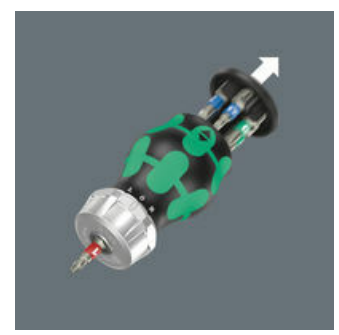
The handle can be opened and thus gives access to the six bits contained in the magazine.