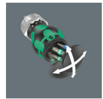
The swiveling bit magazine allows for the bits to be removed easily in almost any situation and cannot be lost. The bits are safely stored.