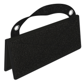
Wera 2go 5 05004354001 1 x 270 x 300 x 135 mm