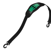
Wera 2go 6 05004355001 1 x 1470 x 38 mm