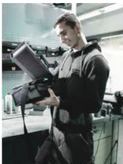
Wera 2go 1 – The outside packer