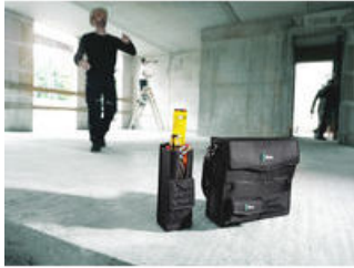
Wera 2go 7 high tool box.