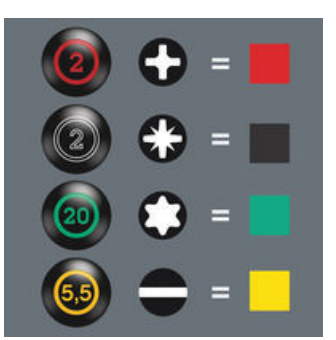
Screwdrivers with "Take it easy" coding tool finder: colour according to profile and size stamp.