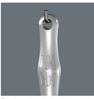
Thanks to its hole the Joker can be neatly hung on the workshop wall.