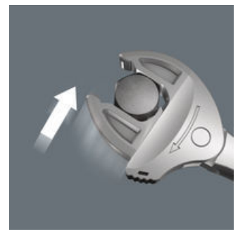
With its automatically and continuously gripping parallel jaws the Joker spanner 6004 covers all dimensions in the respective field of application. The tool automatically finds the required size when placed on the bolt or screw, no setting required.