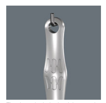
Thanks to its hole the Joker can be neatly hung on the workshop wall.