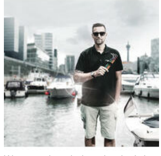
We questioned the classic L-key design, since all too often the screw head recess is rounded out, meaning screws can no longer be tightened or loosened – and so the user finds the L-key slipping out of the recess. Wera Hex-Plus tools have a larger contact surface in the screw head. The notching effects are reduced and thereby the deformation of the screws. At the same time, as much as 20 % more torque can be applied.