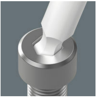
The spherical drive profile means that it is possible to swivel the axis of the tool to that of the screw, and therefore enable angled, "around-the-corner" screwdriving jobs.