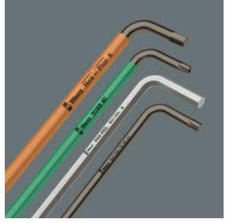
The size of each L-keys has been engraved by a laser. In addition Take it easy L-keys have a colour coding according to sizes – for simple and rapid accessing of the required tool. Making it easy to find the right tool.