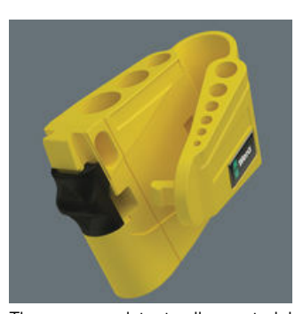
The wear-resistant clip material ensures that the L-keys are securely held yet are easy to remove.