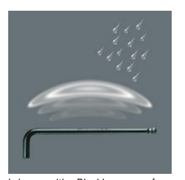
L-keys with BlackLaser surface treatment for outstanding surface protection and long service life. High corrosion protection.