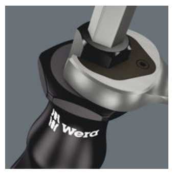
Greater torque can be transferred by fitting an open-jaw or ring spanner over the integrated hex bolster.