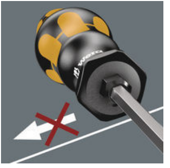
The hexagonal non-roll feature prevents any rolling away at the workplace.