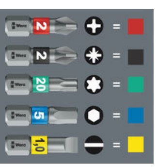
"Take it easy" tool finder with colour coding according to profiles and size stamp – for simple and rapid accessing of the required tool