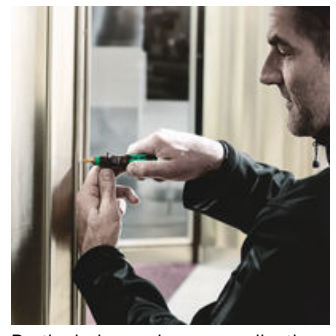
Particularly when applications involve sensitive materials or high quality surfaces are involved, bits with a diamond coating ensure that work is done safer, faster and at lower cost.