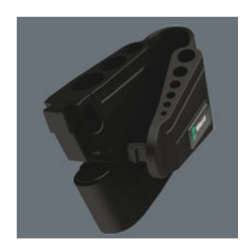
The wear-resistant clip material ensures that the L-keys are securely held yet are easy to remove.

Take it easy tool finder system—with profile and size colour-coding for quick and easy tool selection. Colour-coded system for hexagon drive screws (L-Keys, Zyklop bit sockets), external hex drive screws and nuts (Joker wrenches, Zyklop sockets and Zyklop bit sockets with holding function), and TORX® drive screws (L-Keys, Zyklop bit sockets).