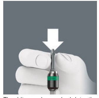
The bit can be pushed into the adaptor without moving the sleeve. The lock is activated automatically as soon as the bit is applied to the screw. Bits are held securely and wobble-free.