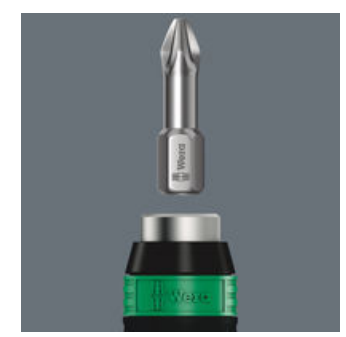
Rapidaptor technology makes the tool adaptable since bits and sockets can be exchanged rapidly.