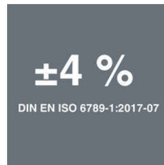
Precise to ± 4% as per DIN EN ISO 6789-1:2017-07.