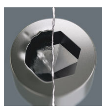
Hexagon screws can endure a problem because the contact surfaces delivering the power from the conventional tool, is transferred to the screw via very small surface areas. The consequence: the screw can become damaged (rounding out). Hex-Plus tools have a greater contact surface that prevents this from happening! At the same time, as much as 20 % more torque can be applied. Good to know: Hex-Plus tools fit into every standard hexagon socket screw!