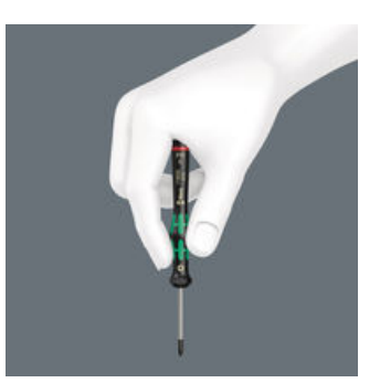
The Kraftform Micro, with its three zones and their specific arrangement, satisfies these requirements perfectly. The freeturning cap that provides support for the hand works with these advantages, enabling quick and easy precision work.