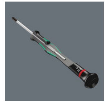
Multi-component screwdriver handle for ergonomic working.