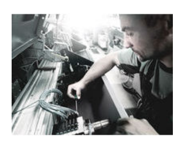
Screwdriving jobs in electrical and precision engineering applications are often tedious and time-consuming. We learned from users what is important for them: working speeds, torque, precision – and we then focused particularly on these issues.