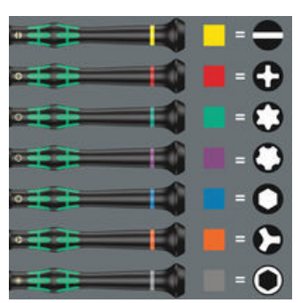
Screwdrivers with "Take it easy" tool finder: colour coding according to profile and size stamp.