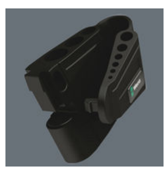
The wear-resistant clip material ensures that the L-keys are securely held yet are easy to remove.