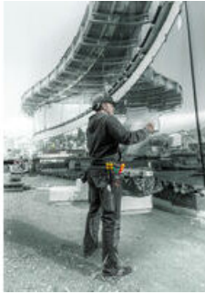
Screwdriver sets in belt holster