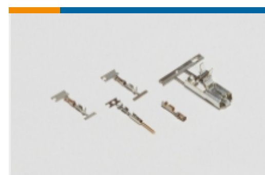
Wire-to-Board Connector Contacts(8)