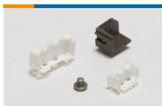
PCB Connector Mounting(46)