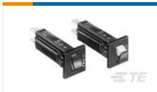
TE Part #6-1393250-9 W28-XT1A-4=W28