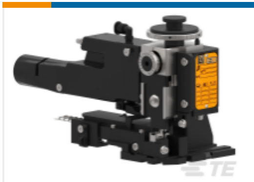
TE Part # 2837499-2 OCEAN-2.0-APPLICATOR-S-042F0750A