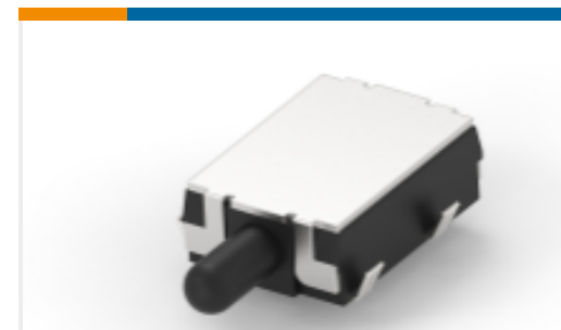
TE Part #2331402-1 DET SW5.7X4.0X2.0 JB HORZ. NOH AG RL