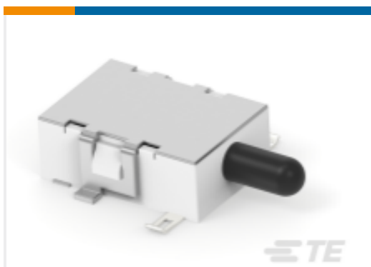
TE Part #2331327-1 DET SW5.7X4.0X2.0 GW HORZ. NC AG RL