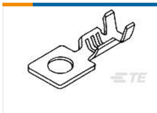
TE Part #61653-1 RING CRIMP 26-24 AWG BR