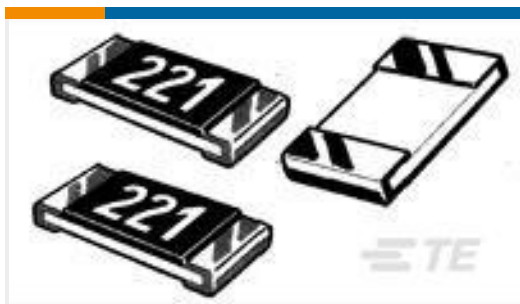
TE Part #2176232-7 3522 240K 1% 3W