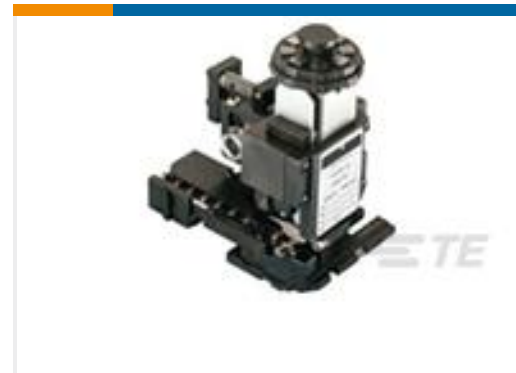
TE Part # 1385378-3 HDM 8SMPR042F0700 G