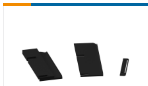
TE Part #1320928-1 STRIP GUIDE