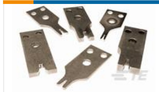
TE Part #2-1333281-7 CRIMPER, WIRE, F PREMIUM (.042")