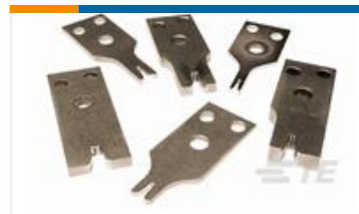
TE Part #1-562108-5 CRIMPER WIRE