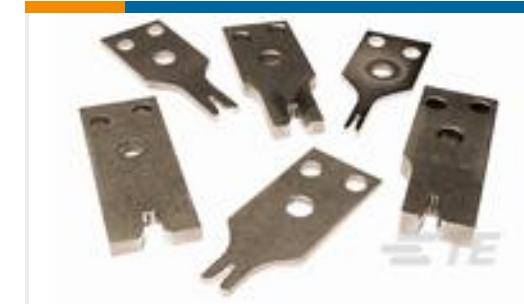
TE Part #9-657555-1 DRAHTCRIMPER