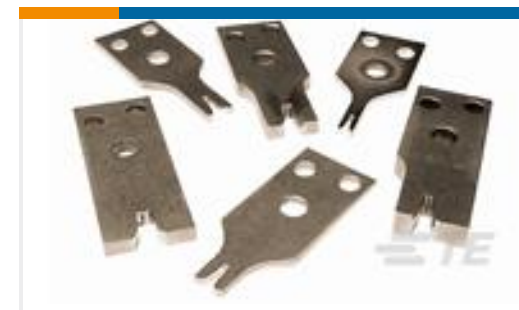
TE Part #1-1673600-0 CRIMPER, WIRE (.050" 'F')