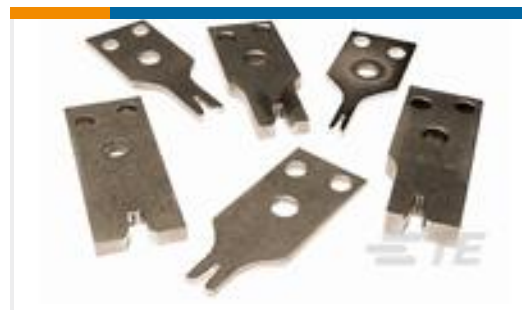
TE Part #456407-5 CRIMPER, WIRE .100 "F"