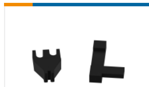
TE Part #1752356-6 SUPPORT, TERMINAL