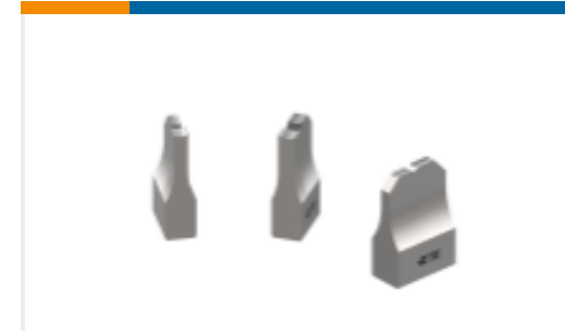
TE Part #6-1633620-7 ANVIL, COMBINATION