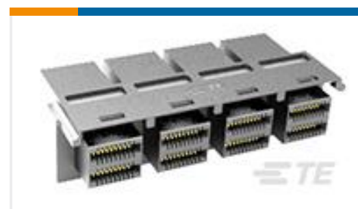
TE Part #2227582-1 1X4 R/A ASSY, MINI SAS HD INTERNAL