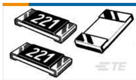
TE Part #1-2176230-9 3522 27R 5% 3W