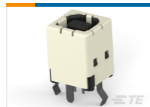
TE Part #5788336-1 STD USB TYPE B, VERTICAL, T/H