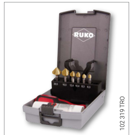
102 319 TRO