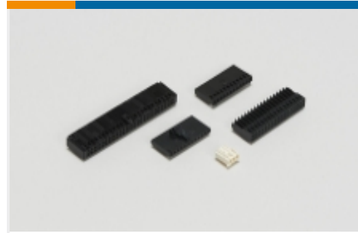
Wire-to-Board Connector Assemblies & Housings(5)