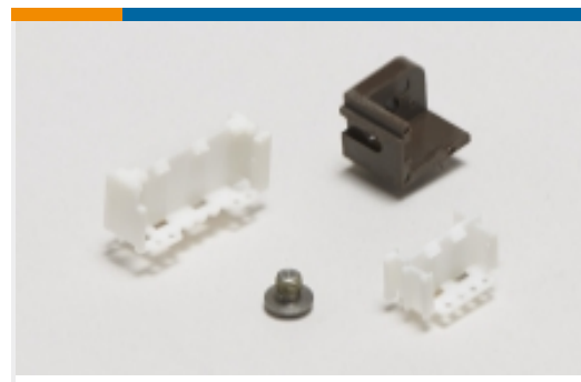
PCB Connector Mounting(1)