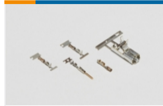
Wire-to-Board Connector Contacts(65)