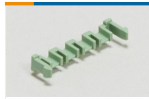
PCB Latches, Locks &amp; Retainers(2)