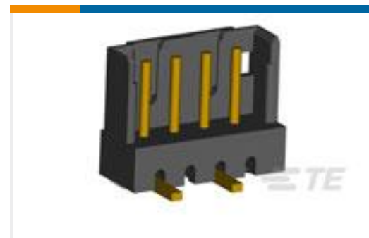
TE Part #292172-4 CT POST HDR ASSY 4P IN-TUBE BL