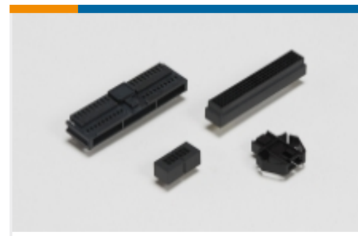
PCB Connector Shrouds(1)