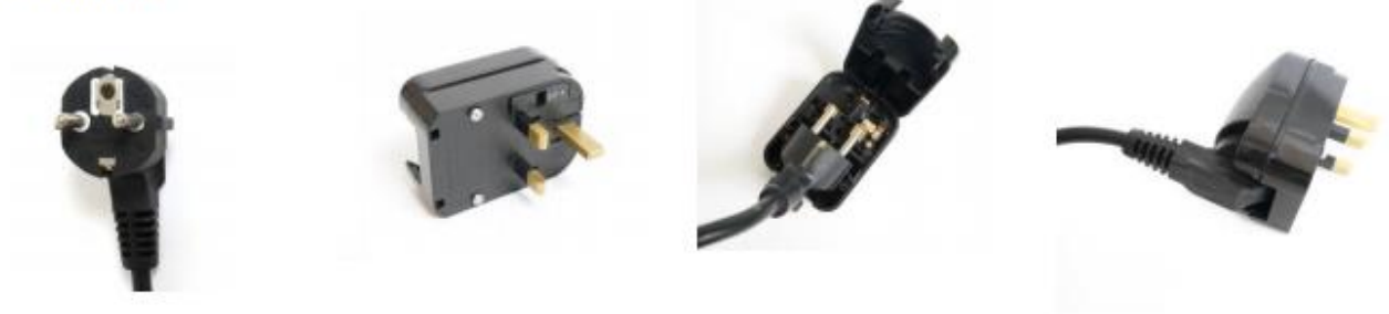
EU B type plug