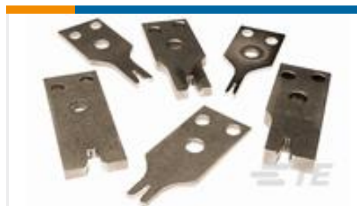
TE Part #1-1752057-3 CRIMPER, WIRE, STEPPED (.070)