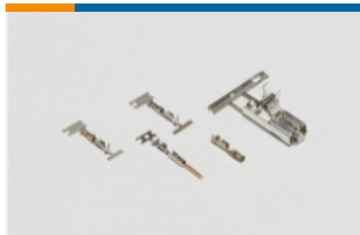
Wire-to-Board Connector Contacts(2)