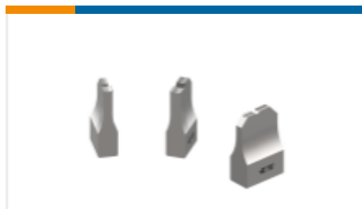
TE Part #1-1333231-1 ANVIL, COMBINATION, SPECIAL