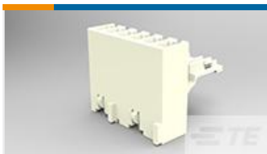
TE Part #1241964-7 STD TIM HOUSING 7P