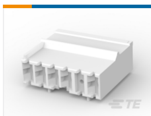
TE Part # 5-1703060-6 STANDARD TIMER SPECIAL HOUSING UL94_V0