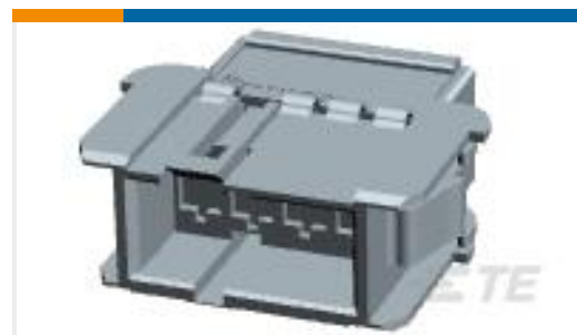
TE Part #9-927742-4 4POS FASTIN FASTON HOUSING