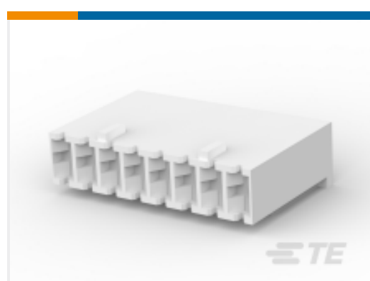
TE Part # 1241980-8 SPECIAL STANDARD TIMER HOUSING 8POS