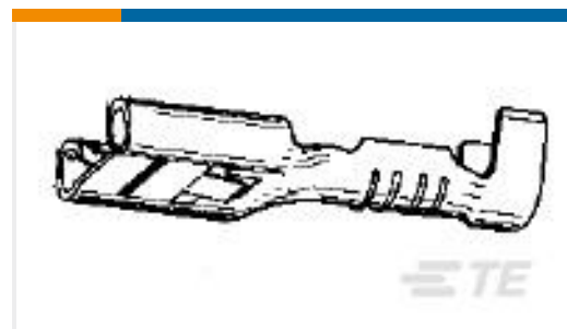
TE Part #282178-1 FF 250 REC 0.3-0.8MM2 BR