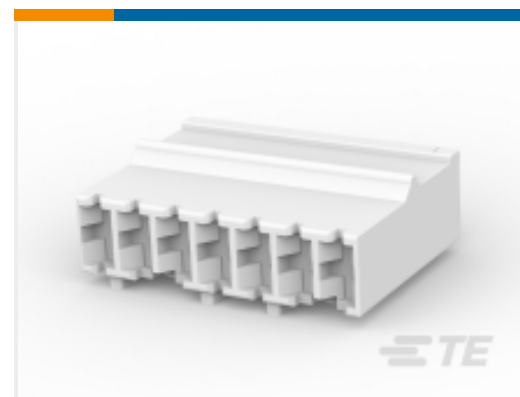
TE Part # 1241964-7 STD TIM HOUSING 7P