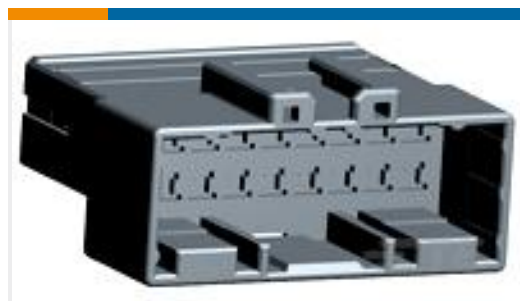
TE Part #936213-2 090III 18P CAP ASSY BLK