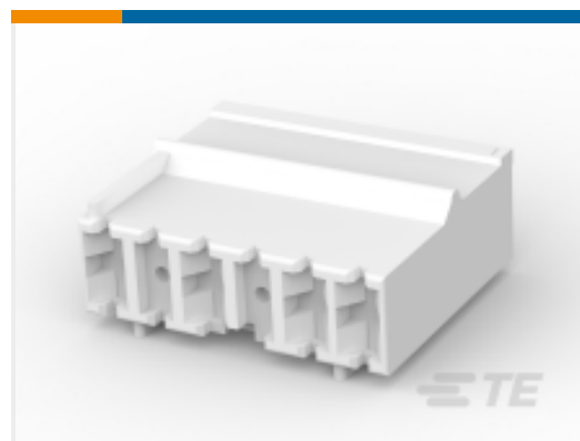
TE Part # 8-1703060-6 STANDARD TIMER SPECIAL HOUSING UL94_V0