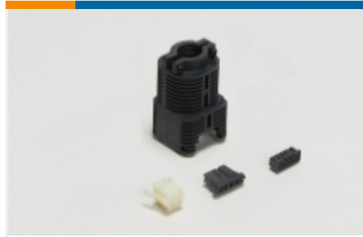
Rectangular Connector Housings(1)