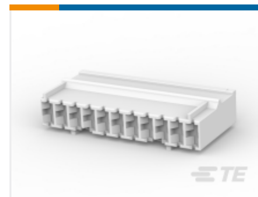
TE Part # 1-1241964-1 11POS STANDARD TIMER HOUSING