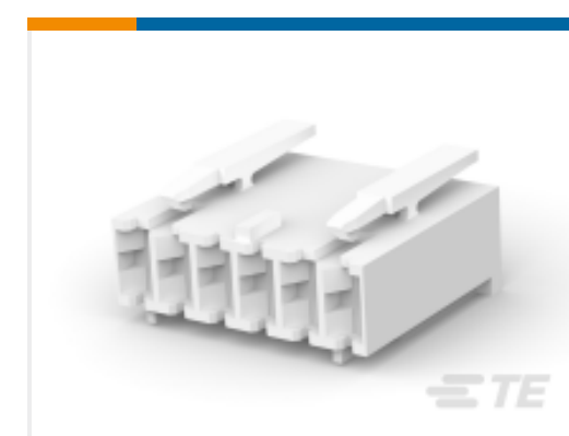
TE Part # 1241965-6 STD-TIMER GEH 6P