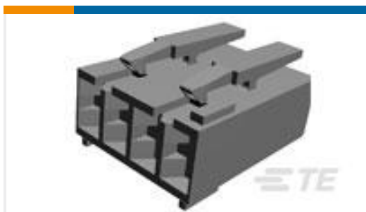
TE Part #2-1241959-4 STD TIM HOUSING MKII 4POS