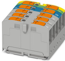
Distribution block, color: gray

Please be informed that the data shown in this PDF document is generated from our Online Catalog. Please find the complete data in the user documentation. Our General Terms of Use for Downloads are valid.