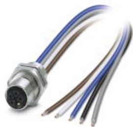
Flush-type connector, Power, 5-position, Socket, M12, L-coded, Rear mounting, M16 x 1.5, Individual wires, cable length: 0.2 m

Please be informed that the data shown in this PDF Document is generated from our Online Catalog. Please find the complete data in the user's documentation. Our General Terms of Use for Downloads are valid ( http://phoenixcontact.com/download )