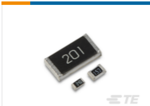
TE Part #2176330-1 CRGP 2010 10R 1%