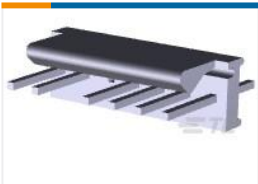
TE Part #644178-1 07P MTA100 HDR ASSY W/O#5