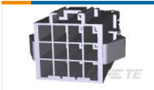
TE Part #177913-1 POWER DBL LOCK CAP HSG P/M 12P