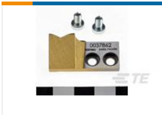
TE Part #874547-9 LOWER CUTTING BLADES