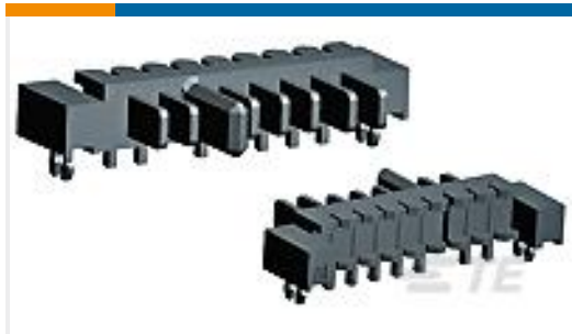
TE Part #1827654-1 2mm pitch Battery Plug Assy. 7Pos. H=4.0