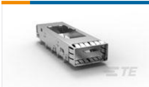
TE Part #1888617-1 Cage Assy, QSFP, Through Bezel