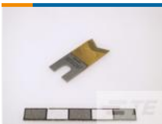
TE Part #874547-5 UPPER CUTTING BLADES