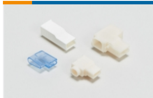
Crimp Terminal Housings(212)