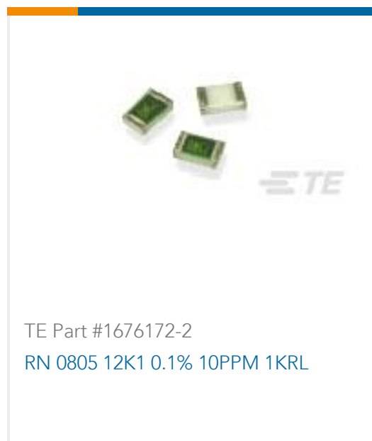
TE Part #1676172-2 RN 0805 12K1 0.1% 10PPM 1KRL