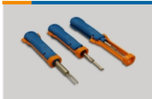
Insertion &amp; Extraction Tools(2)