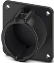
Retainer for Vehicle Connector as parking position at charging stations (EVSE), Type 1, SAE J1772

Please be informed that the data shown in this PDF Document is generated from our Online Catalog. Please find the complete data in the user's documentation. Our General Terms of Use for Downloads are valid ( http://phoenixcontact.com/download )