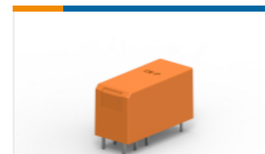
TE Part #1-1415899-1 PCB Power Relay: 12-16 Amp, Monostable