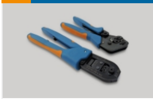
Hand Crimping Tools(4)