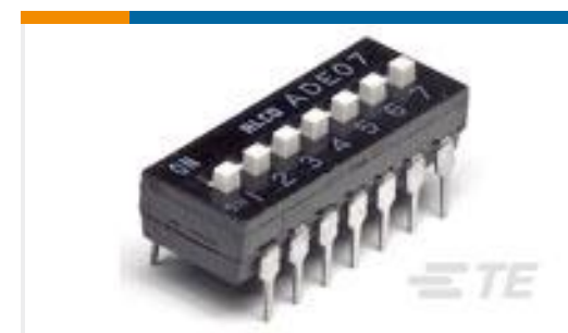
TE Part #1825057-5 ADE0604=DIP SWITCH,EXT,THRU/HL