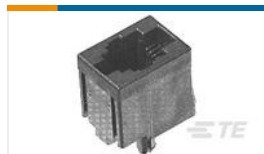
TE Part #216550-1 8/8 PCB MOD.JACK TE