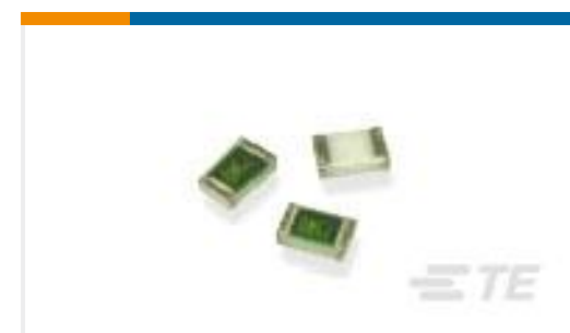
TE Part #1676474-2 RN 0805 9K53 0.1% 10PPM 1KRL