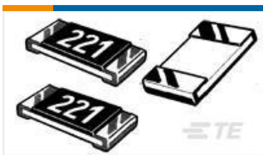
TE Part #1-2176070-1 3521 27R 1% 2W