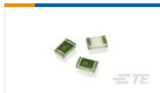
TE Part #1676324-2 RN 0805 3K16 0.1% 10PPM 1KRL