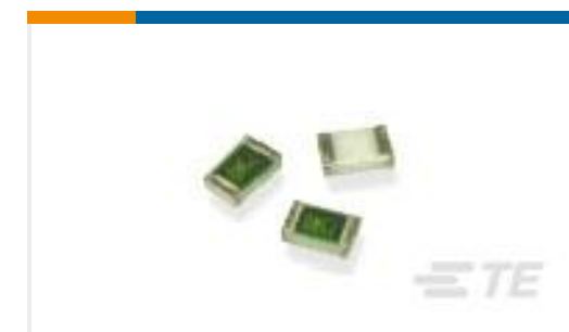
TE Part #1676173-2 RN 0805 12K4 0.1% 10PPM 1KRL