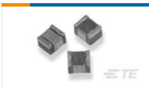
TE Part #6-1624113-8 3650 2A 1.2uH 5% 2K RL