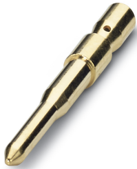
Crimp contact, turned, contact diameter: 1.5 mm, crimp range: 0.14 mm 2 ... 0.56 mm 2

Please be informed that the data shown in this PDF Document is generated from our Online Catalog. Please find the complete data in the user's documentation. Our General Terms of Use for Downloads are valid ( http://phoenixcontact.com/download )